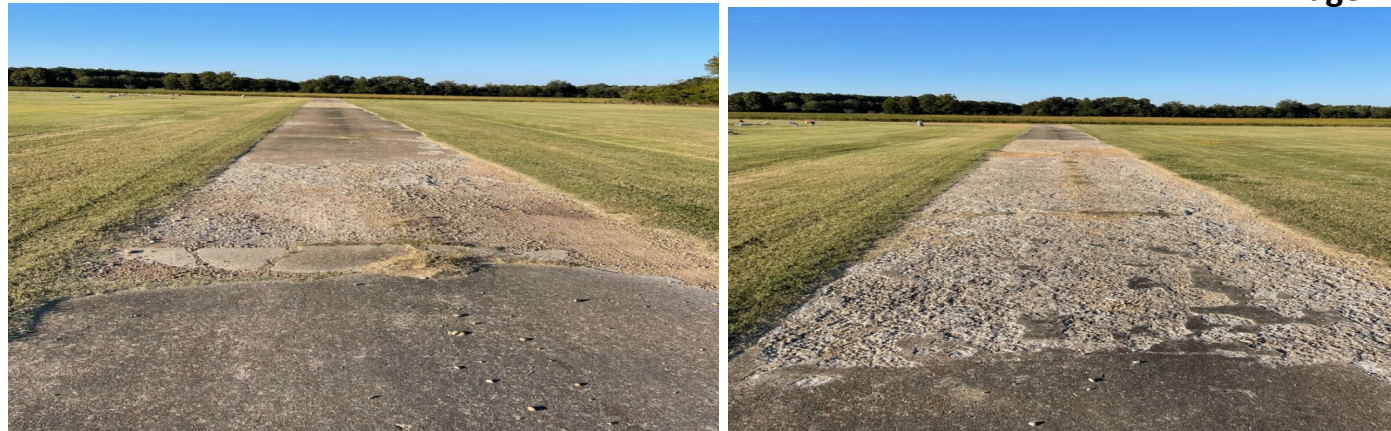
Immediate maintenance needs — Several hundred feet of concrete needs to be replaced at the Odd Fellows East Cemetery. The pictures above show the worst sections in need of repair.